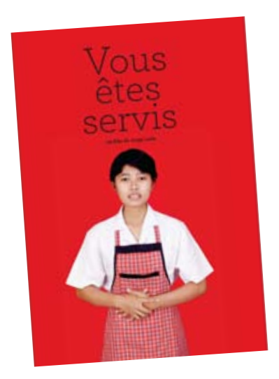
"Vous êtes servis" by Jorge León (2010)

The documentary showed that what happens in the country of origin has a direct impact on what happens in the country of destination. It also highlighted the issue of social class and status; most of these women do not hold a position of power in their own communities.