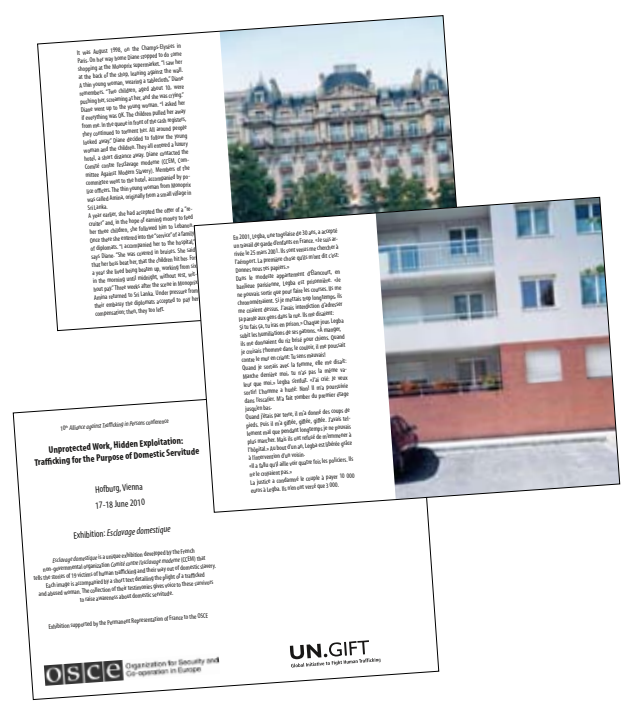
"Esclavage domestique" is a unique exhibition developed by the French non-governmental organization Comité Contre l'Esclavage Moderne (CCEM) that tells the stories of 19 victims of human trafficking and their way out of domestic slavery. Each image is accompanied by a short text detailing the plight of a trafficked and abused woman. The collection of their testimonies gives voice to these survivors to raise awareness about domestic servitude.

The conference provided an excellent forum to gather expertise, exchange good practices and develop recommendations on what more can be done to tackle the issue of trafficking for domestic servitude. The event was accompanied by the presentation of a photo exhibition and screening of a documentary film followed by a debate with the Belgian photographer and filmmaker, both of which gave fresh insights into trafficking in human beings for domestic servitude.